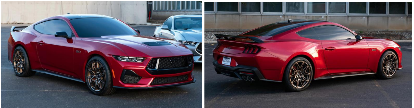
The Mustang GT displayed at the 2023 Detroit International Motor Show

There's to be a V8 RHD F150 too, but it's a factory-approved Australian conversion for the local market only.