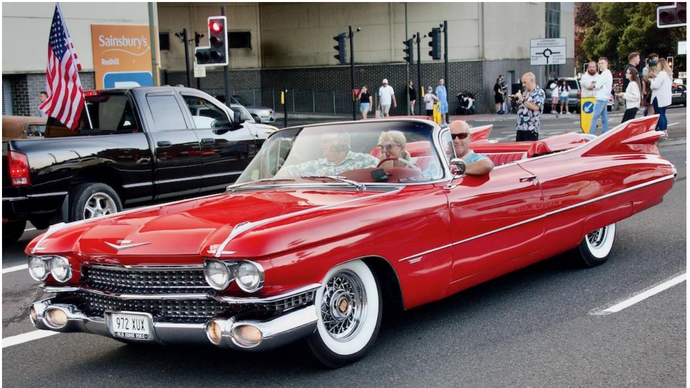
Ian Hunt provided this shot of a gorgeous '59 Caddy during the 2024 Redhill Cruise