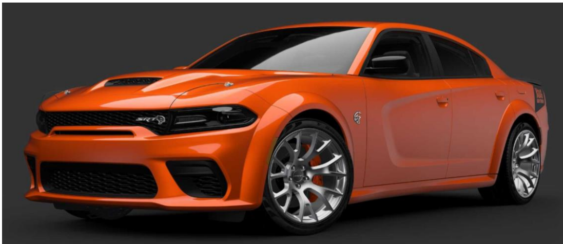
King Daytona Chargers can be any shade of hemi orange so long as it's Go Mango

Also alive and surviving for just one more year in V8 form are four-door Charger sedans. Heading the pack is the most powerful Charger ever to be offered by the factory – the King Daytona, which is a Charger SRT Hellcat Redeye Widebody with a blown 6.2 pushing out no less than 807 brake horsepower. This model is not just awash with words, it's got the eight-speed auto and rides on 20-inch Satin Carbon Warp Speed wheels (“Warp Speed wheels”. We like that!) Go Mango orange body paint with black graphics and matching orange Brembo brakes. The King Daytona nametag is a tribute to sixties and seventies LA street racer “Big Willy” Robinson, who built and raced the original hemi-orange King Daytona Charger.