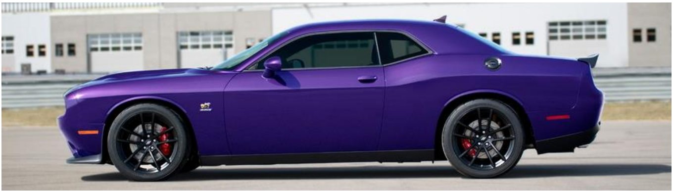
2023 Challenger in Plumb Crazy purple recalls the cool early seventies

There are no less than 14 body colours available for the Challengers, including retro “heritage” delights such as Go Mango, Destroyer Gray, Hell Raisin’ (purple), Sublime (green), Pitch Black and Frostbite.