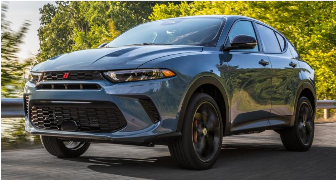
Hybrid Hornets run on pump gas or electricity and are Alfa Romeos under the skin

R/T 4x4 Hornets feature higher levels of trim and start from $40,000. They have a 1.3-litre turbo engine, and in electric mode, produce 285 horsepower and 383 lb-ft of torque. The R/T Hornets have a six-speed box.